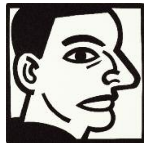
'Look-alike', 1998, linocut on BFK Rives 180 gsm, image size 20 x 20 cm. Edition 30. Printer: Dianne Fogwell (Artist Book & Editions at ANU)