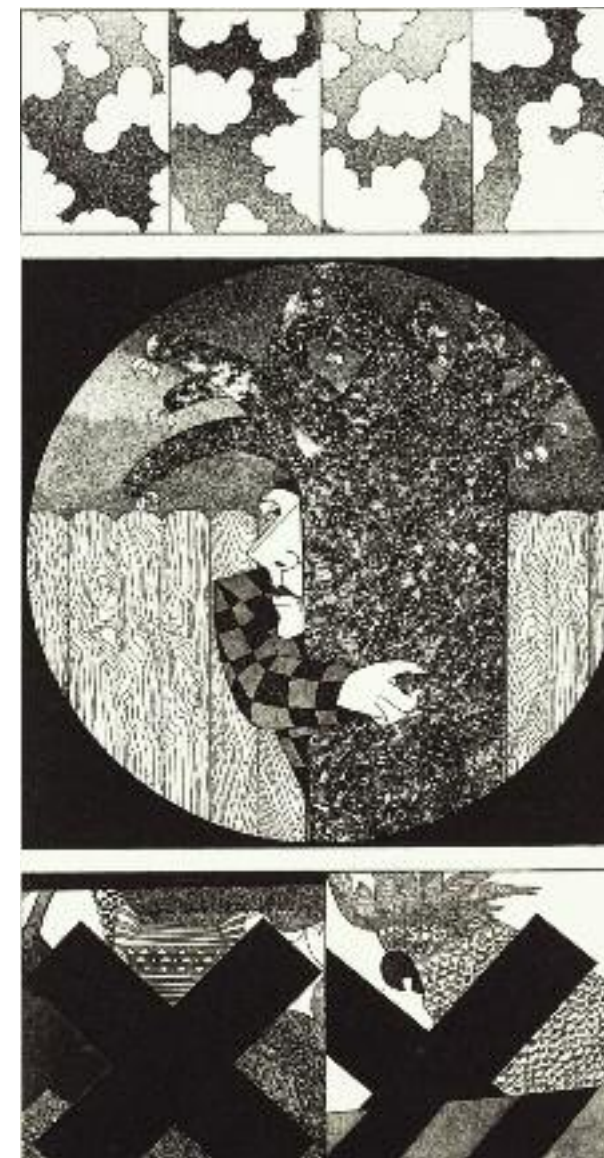
'Two in the Bush', 1979, etching and aquatint on Hahmemuhle 230 gsm, image size 45.5 x 24 cm. Edition 10. Printed by the artist

Winter Fragrance , 2003, lithograph (four colours) on Somerset paper, 24 x 21 cm. Edition 15. Printer: Peter Lancaster (Lancaster Press)