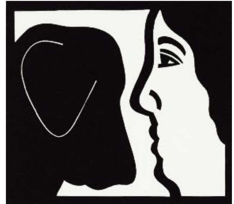
'Profiles', 1999, linocut on Zerkal Woven 140 gsm, image size 18 x 19 cm. Edition 15. Printed by the artist