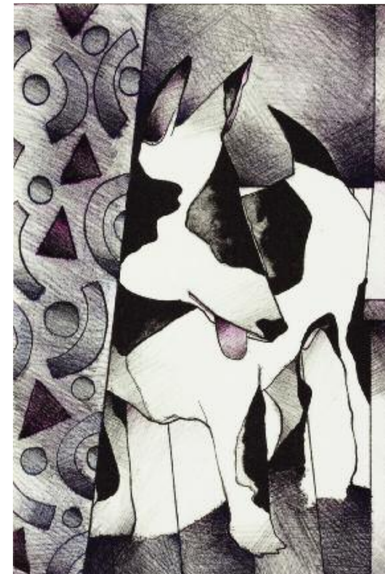
'Dog', 1982, lithograph (four colours) on BFK Rives 250 gsm, image size 50 x 75 cm. Edition 10. Printer: Kaye Green

His prints are deliberately enigmatic, often imply a narrative with self-referential iconography, but there are few clues for any meaningful decipherment. As in a Piero fresco, movements deliberately betray little emotion and monumental forms are stripped bare to their essentials so that nothing more can be taken away without loss of legibility. There is a sense of theatricality, or at least a shallow stage-like space, where the bulky figures perform their slightly absurd rituals, such as juggling with balls, rushing to a landfill, a snail admiring its shadow, a man admiring a snail or a dog, funny little heads or simple compositions reminiscent of tarot cards. The dour Scot is a much abused stereotype and the cool restraint of Heng's art, where nothing is overstated, but all is distilled, refined and if anything is understated, can lead to a simplistic reading of his prints. They are in fact imbued with humour, a dry, subtle, subversive and witty commentary on life, often masked by an apparent one liner. Over a four-decade practice as a printmaker, as well as painter, draughtsman and neon artist, the closest parallel remains that with Léger and his majestic, monumental simplicity. In a famous aphorism attributed to Léger,