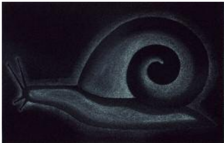
'Nocturne', 2005, etching and aquatint on Somerset paper, image size 23.5 x 36.5 cm. Edition 30. Printer: Andrew Gunnell (Chrysalis Publishing)