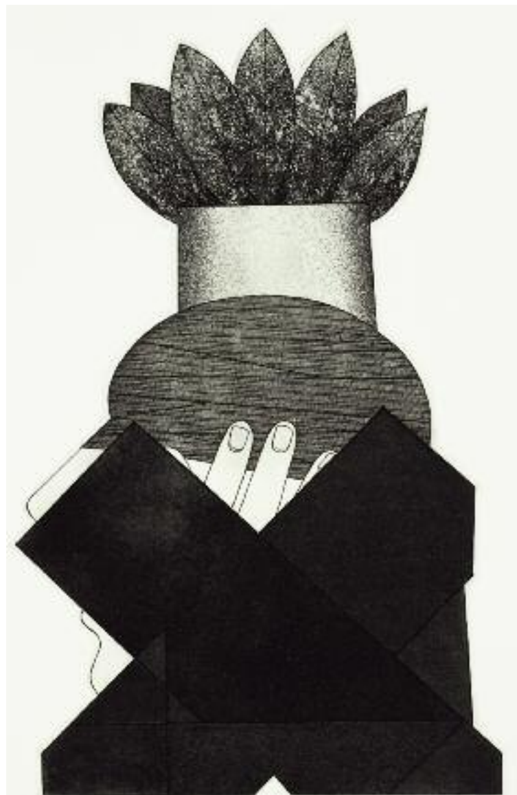
'Head Piece', 1980, etching and aquatint on Hahmemuhle 230 gsm, image size 44 x 27 cm. Edition 10 (incomplete). Printed by the artist